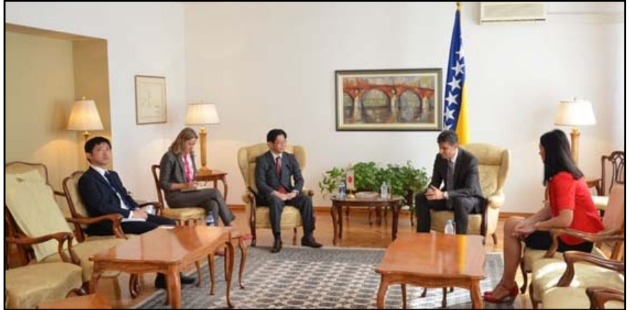
Since the end of war, Japan has invested approximately one billion KM in BiH